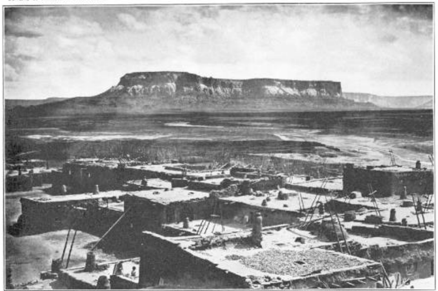
TOWA YAL'LANNE (CORN MOUNTAIN), ZURI PUEBLO IN THE FOREGROUND