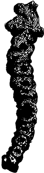
FIG. 4 - SCOPOLIA the Sophistican of Belladonna

Hyoscyamine ( C_{17}H_{23}NO_3 ) is the principal alkaloid of Belladonna; by its transformation, chemists make atropine, which has the same formula. Hyoscine ( C_{17}H_{23}NO_3 ) was discovered by Ladenburg; Chrysoatropic acid by Kunz; Atrosin and Belladonnine by Hiibschmann. Succinic acid, malates, oxalates, combined with sodium, potassium and magnesium, are conceded by all analysts. These, together with gum, wax, asparagin, and chlorophyl (in the leaves only), starch, and albuminous bodies that are peculiar not only to Belladonna, but to most plants, constitutes the Belladonna products and educts, to which may be added certain artificial alkaloids produced from atropine, but more distant even than atropine, from natural Belladonna tissue.