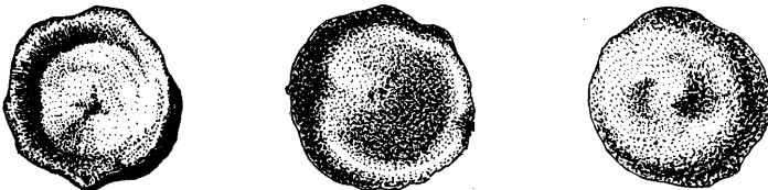
C. - SEEDS OF STRYCHNOS NUX VOMICA. Slightly reduced.

from one to five disc-like seeds, which are intensely poisonous in character. (See cuts A and B.)