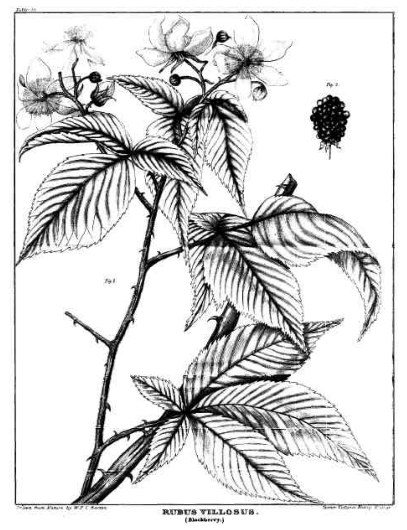
AMERICAN JOURNAL OF PHARMACY - Volume 53, #12, December, 1881 Page 1 The Southwest School of Botanical Medicine http://www.swsbm.com