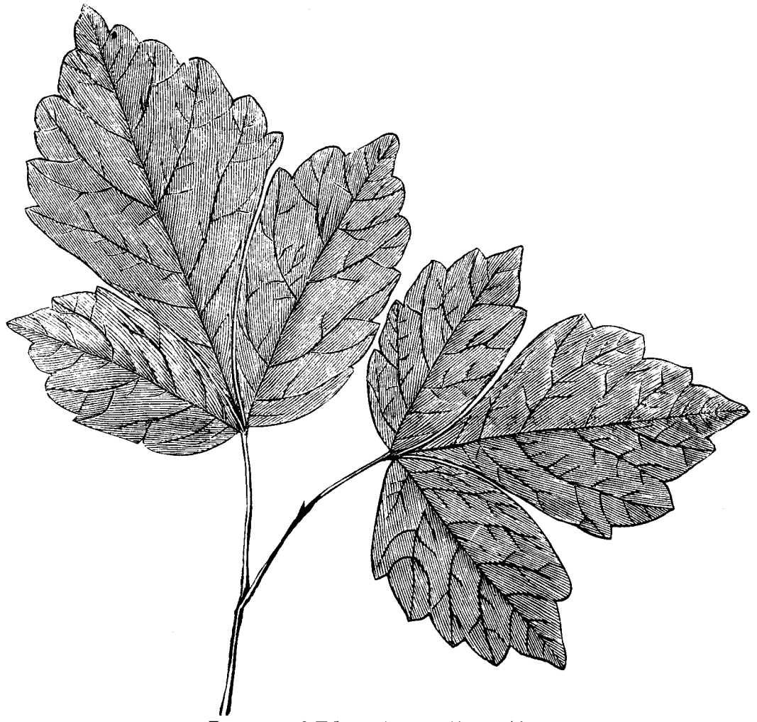
Leaves of Rhus Aromatica, Aiton.

colored, and striate. The bark is brittle, breaks with a somewhat granular fracture, yields an ochre-colored powder, and has a distinct, rather pleasant odor, more marked when green than when dry; its taste is astringent, aromatic and slightly bitter when fresh, with a flavor peculiar to the plant from which it is derived. It should be collected in the spring of the year.